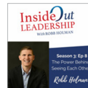
Inside Out Leadership