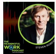
The Meaningful Work