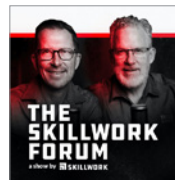
The Skillwork Forum