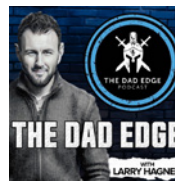
The Dad Edge